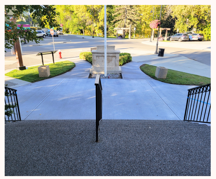
New paving at the entrance: clean and contemporary