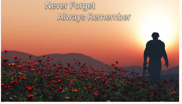
Royal Canadian Legion High River Branch Poppy Campaign begins on Oct 25, 2024

Buy a Poppy or Donate Directly to the Poppy Fund