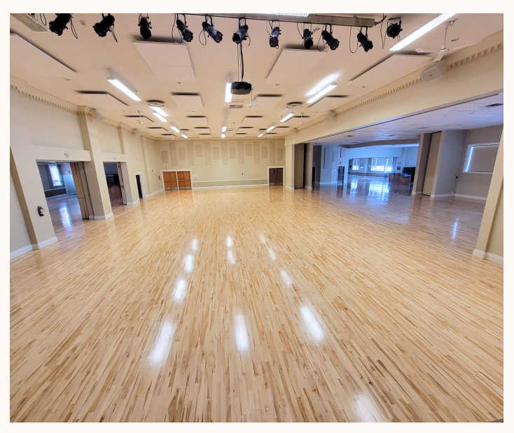
The newly restored hardwood floors have brought a renewed brightness

This renovation will support many more years of events at the Highwood Centre.